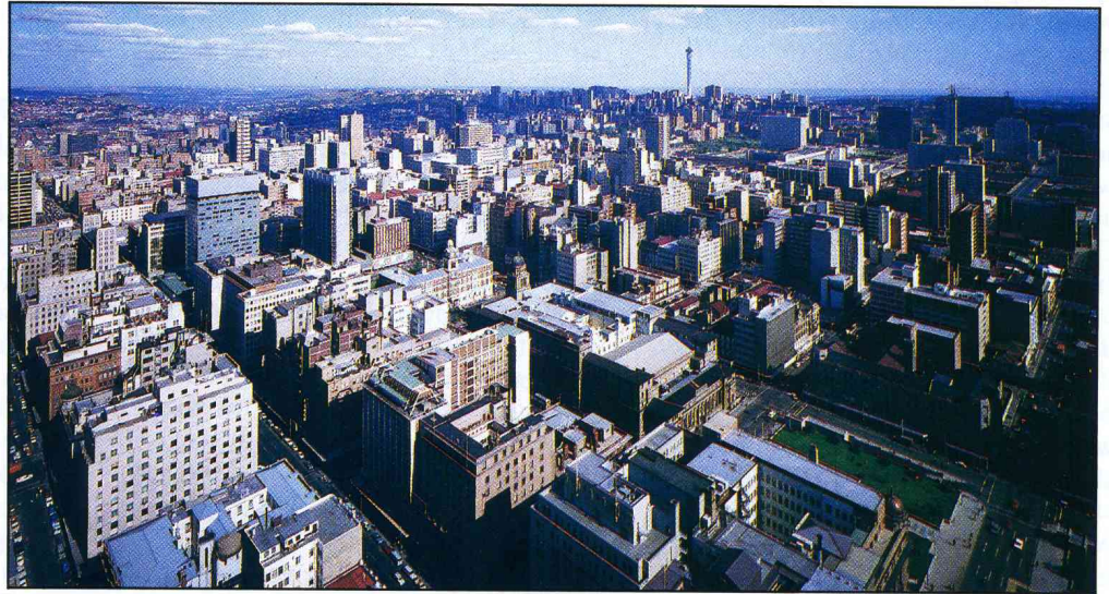
The skyline of Johannesburg, South Africa, a bustling, modern city and the site of the Work's office in southern Africa. God's Work in southern Africa is enjoying substantial increases.

By 1967 Plain Truth subscribers numbered 9,000, with more than 800 readers taking the Bible Correspondence Course. Most new subscribers